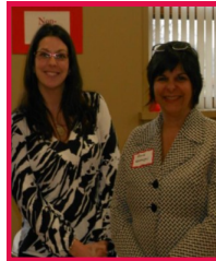
Women's Initiative of the United Way of Central Massachusetts