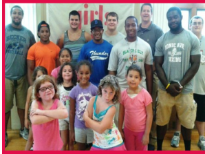
Becker College Student Volunteers