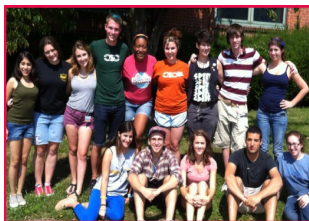
Boston University Student Volunteers

Leominster Credit Union Massachusetts College of Pharmacy North High School Quinsigamond Community College St. John's High School South High Community School