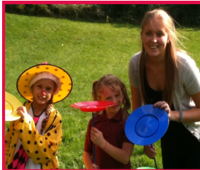
Big Brothers Big Sisters