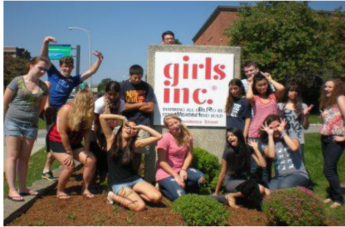
Boston University Community Service Center

290 Volunteers! Over 7,360 volunteer hours served!!