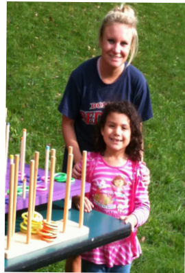
Big Brothers Big Sisters