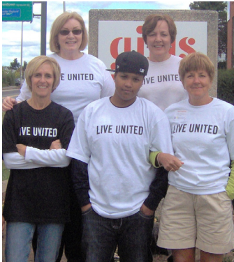
United Way of Central Massachusetts Women's Initiative

Girls Inc. of Worcester thanks our dedicated volunteers who tirelessly served our agency for 2010-2011. We couldn't do it without you!!